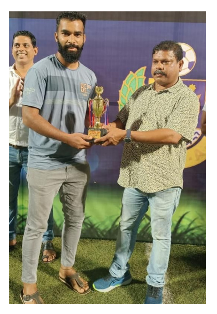
Upcoming Team: United Uccasaim SCC